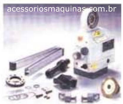
For Longitudinal X Axis 500S Type Series